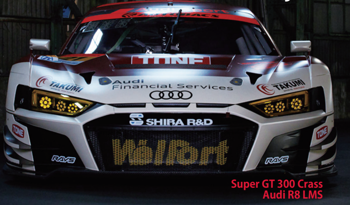
Super GT 300 Cross Audi R8 LMS